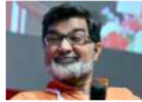
Ziya Us Salam

Mr. Modi side-stepped the systematic diminution in Muslim representation in all spheres of life. In the Karnataka Assembly elections in May, the BJP did not put up a single Muslim candidate in a House of 224 Members of