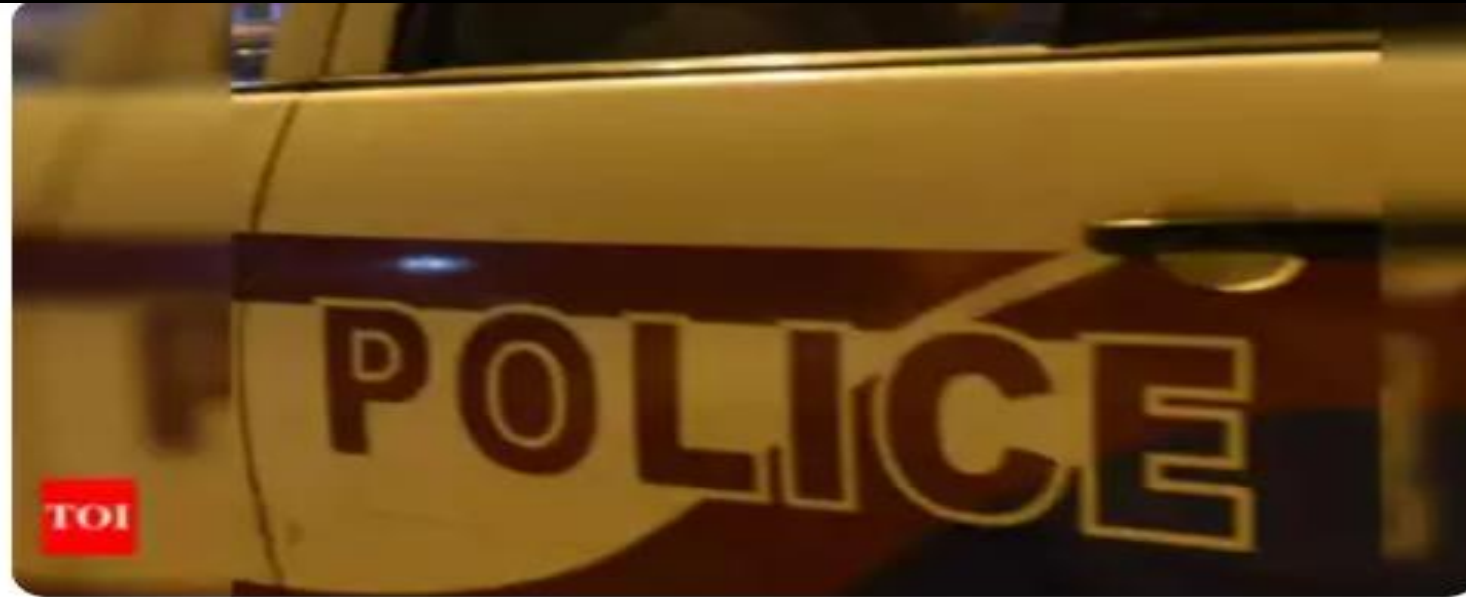
Image used for representational purpose only

MUMBAI: A 21-year-old diploma in pharmacy student allegedly died by suicide at her Nalasopara home on Friday and has named five building residents, including a 20-year-old male friend and three minor sisters aged 7, 10 and 17 in her note.