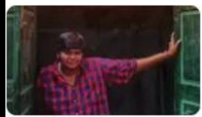
Karthik Subbaraj wants to make 'Jigarthanda' a franchise film

Vijay Sethupathi starts shooting fir his 51st project with Arumugakumar in Malaysia. Fans surround the actor at the movie shooting spot. Watch the video as Vijay Sethu ... Read More