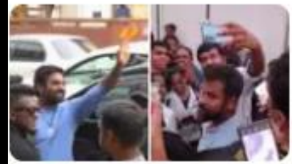
Vijay Sethupathi gets swarmed by fans in Malaysia

Vijay Sethupathi starts shooting fir his 51st project with Arumugakumar in Malaysia. Fans surround the actor at the movie shooting spot. Watch the video as Vijay Sethu ... Read More