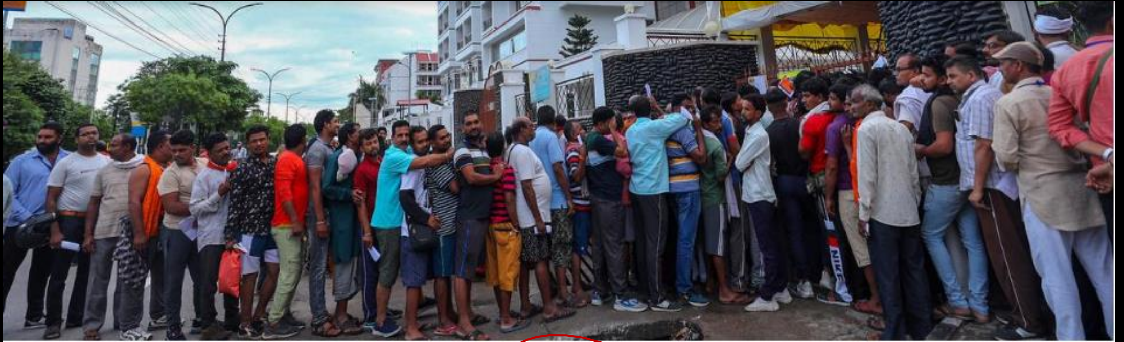
Pilgrims wait in queues to get themselves registered for the Amarnath Yatra 2023, in Jammu, Sunday, July 9, 2023.