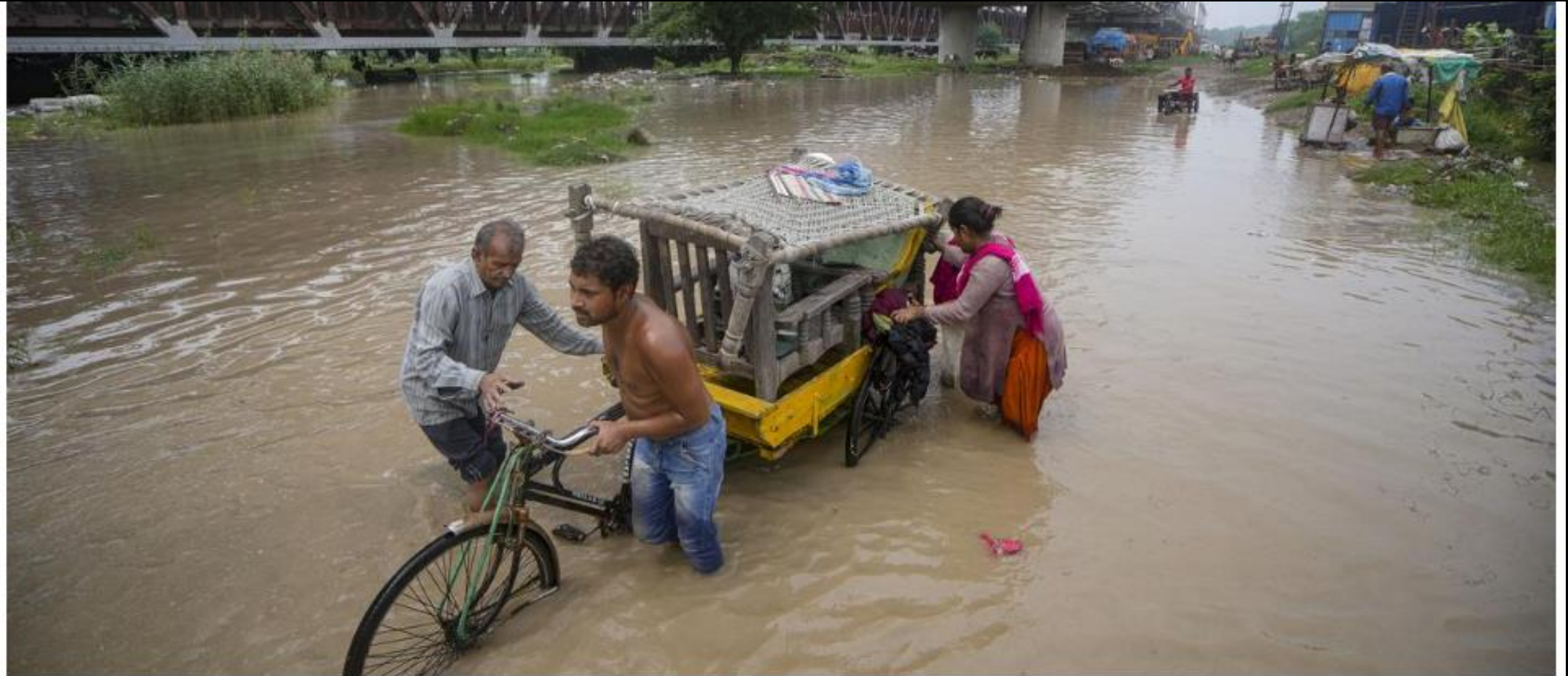
People from low-lying areas around the Yamuna river carry their belongings while relocating to a safer place, in New Delhi, on July 11, 2023.

The rain ebbed in some places in north India and pelted down in others on July 11 with at least seven more people dead and hundreds stranded as raging waters gushed through villages, towns and fields – from Rajasthan to Himachal