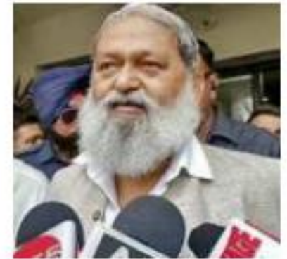
Haryana Home Minister Anil Vij

“Bullets were fired from hills, stones were collected