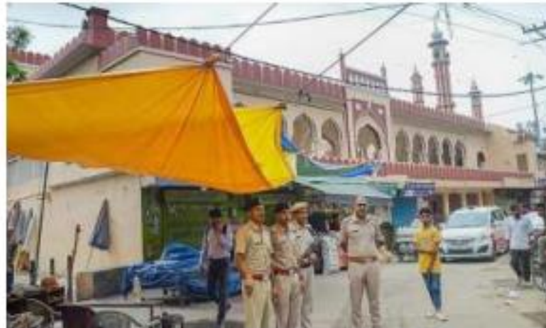
Policemen stand guard during Friday prayers at Jama Masjid, Sadar Bazar, in Gurugram on Friday.

“In view of the prevailing situation, the adminis-