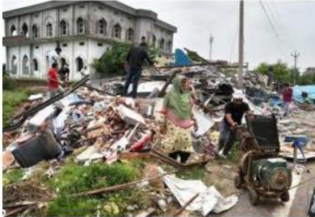
Razed: 'Illegal constructions' being demolished in violence-hit Nuh district on Saturday.