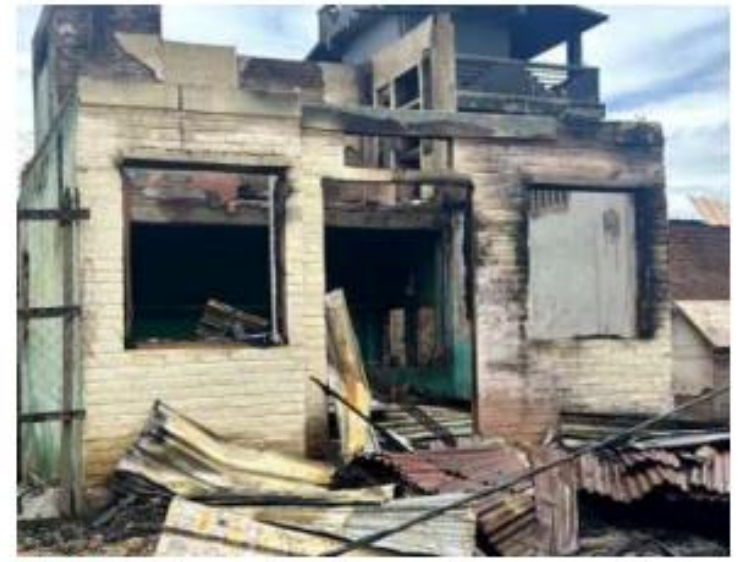
Hard choice: As many as 45 Tamil homes and shops were burnt down in Moreh, a town bordering Myanmar.

"The Chief Minister can influence security forces in Tengnoupal, hence Kukis want the support of other communities such as Tamils, to strengthen their