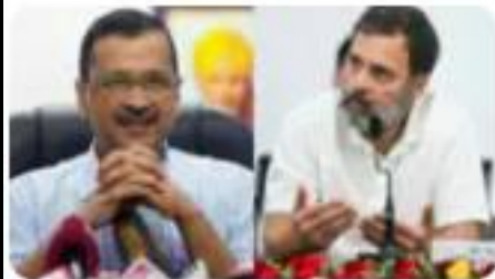
Did Rahul rebuff Kejriwal's support plea on ordinance?