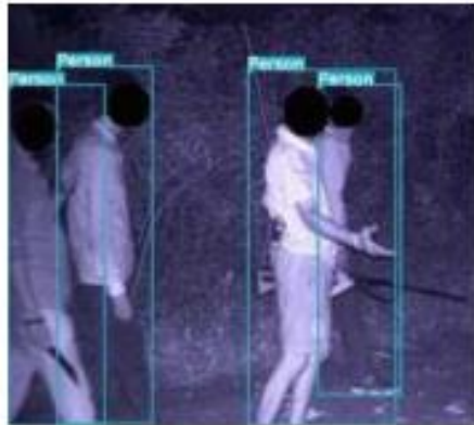
Poachers caught on an AI camera.

Cameras set up in remote regions are a key tool in surveys and census counts of tigers and elephants but have limitations such as requiring personnel physically access the machine to prise photos.