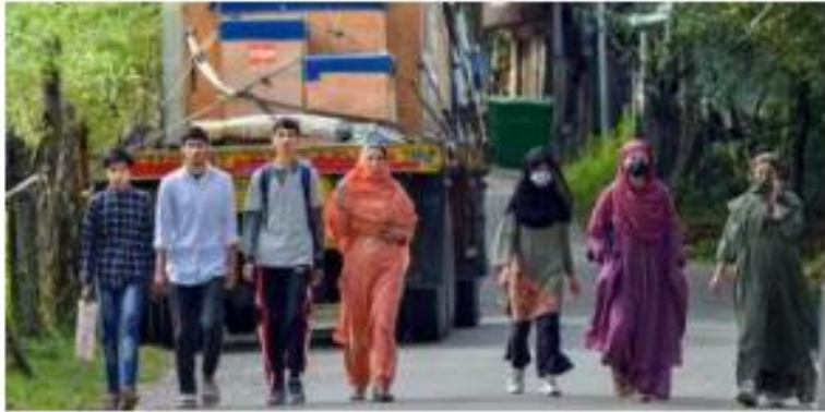
Tension in the air: Civilians walk past the site of an encounter, in Anantnag district of Jammu and Kashmir, on Saturday.