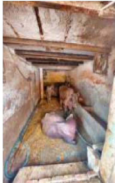
The report found several issues, such as overcrowding at the dairy colonies.

The inspection report, which was submitted to the court last week, found