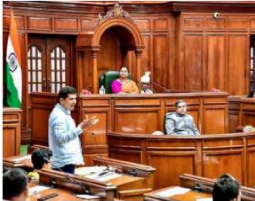
Deputy Speaker (in chair) said House was convened as per rules.

The L-G, in his letter, had termed the summoning of the Assembly as a "grossly anomalous situation", adding that the two-day session should have