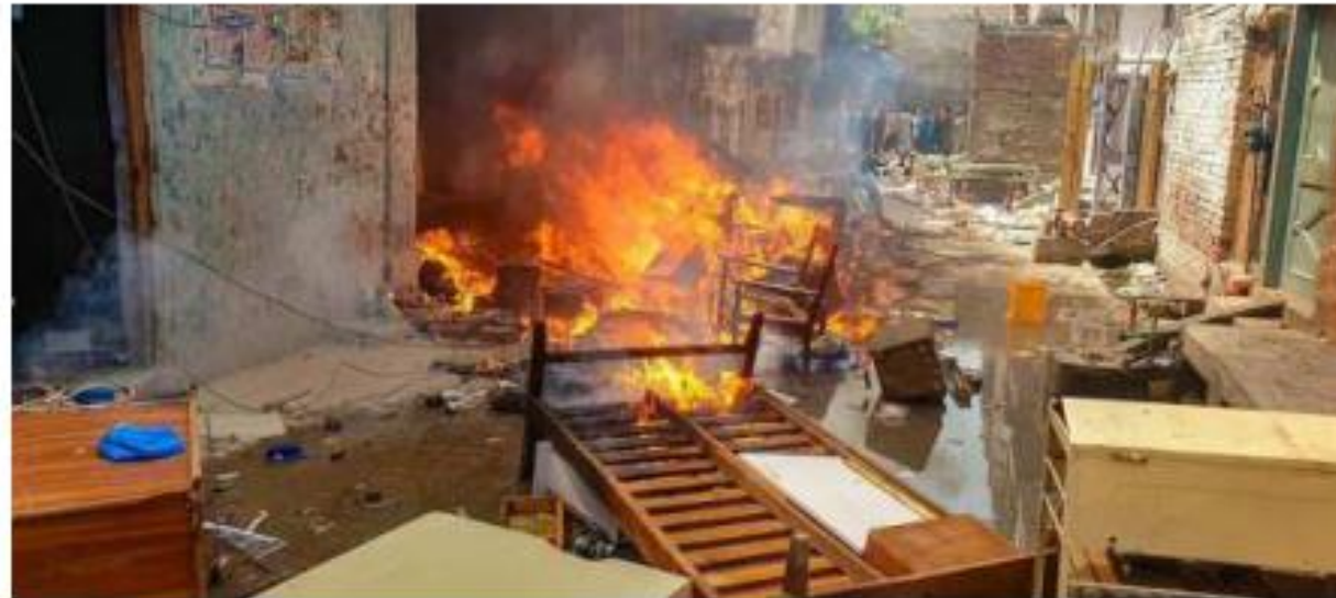
Charged crowd: Church properties set ablaze after being attacked by a mob over blasphemy allegations, in Pakistan's Faisalabad, on Wednesday.