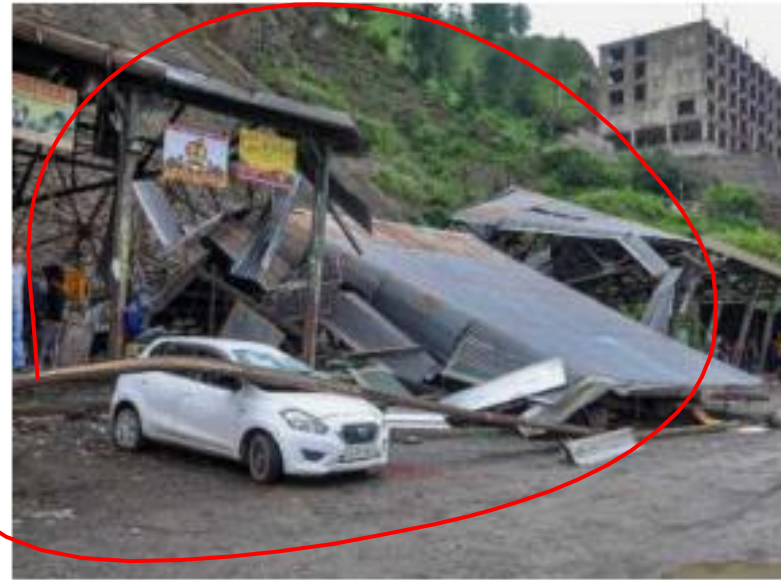
Squashed in rain: Damaged sheds of the Bhattakufer apple market after a landslide due to heavy monsoon rainfall, in Shimla.

"After heavy rain lashed the State, intermittent rain is still continuing. Roads are blocked by rocks and muds dumped by landslips. The soil has loosened, and fruit dropping can't be ruled out in the days to come. With the ongoing rain, plucking of the early varieties of apple is delayed. Even if the apples are plucked, they can't be transported to key cities such as Shimla or Chandigarh as roads are blocked at several places. The