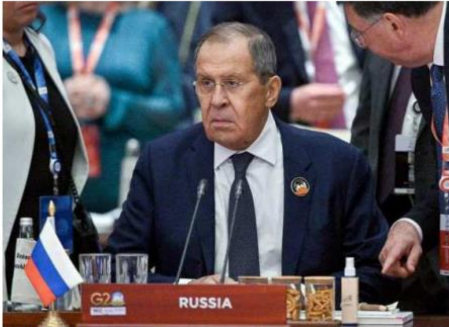
Tough call: Russian Foreign Minister Sergey Lavrov attends the Plenary Session of the G-20 Leaders' Summit at Bharat Mandapam in New Delhi on Sunday.