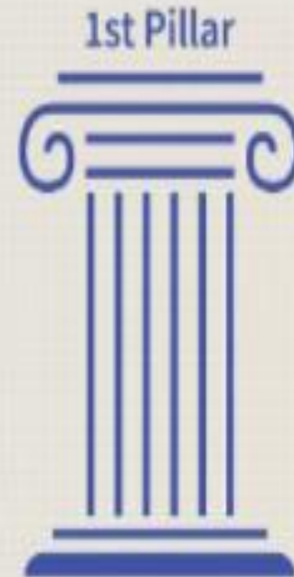
1st Pillar Minimum Capital

The on-going reform of the Basel Accord relies on three "pillars" : a new capital adequacy requirement, supervisory review and market discipline. This article develops a simple continuous-time model of commercial banks' behavior where interaction between these three instruments can be analyzed.