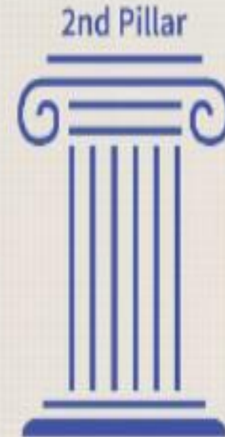
2nd Pillar Supervisor Review