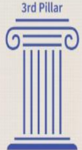
3rd Pillar Market Discipline