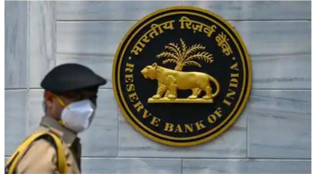
A security personal walks past an entrance of the Reserve Bank of India (RBI) headquarters in Mumbai on May 5, 2021.

RBI to transfer ₹99,122 crore surplus to central government