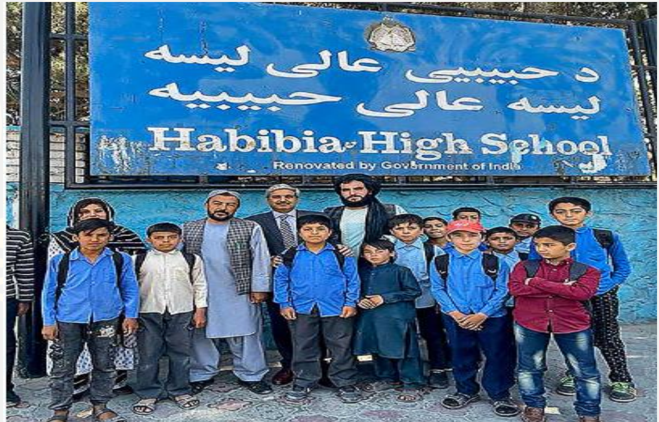
Officials with children at a school renovated with Indian help in Kabul.