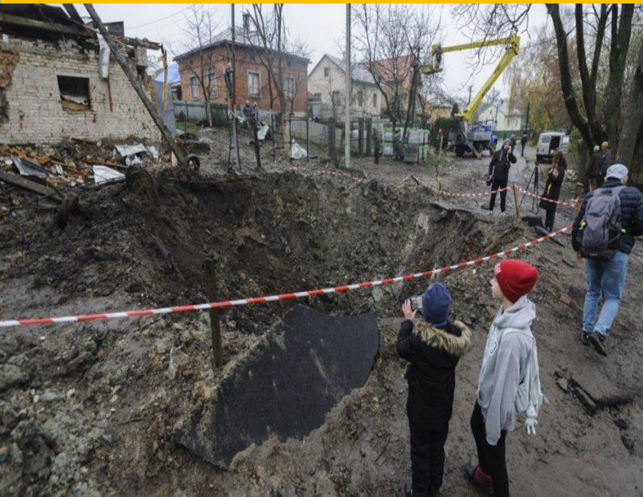
Polish Village Near Ukraine Border Is Struck by Rocket