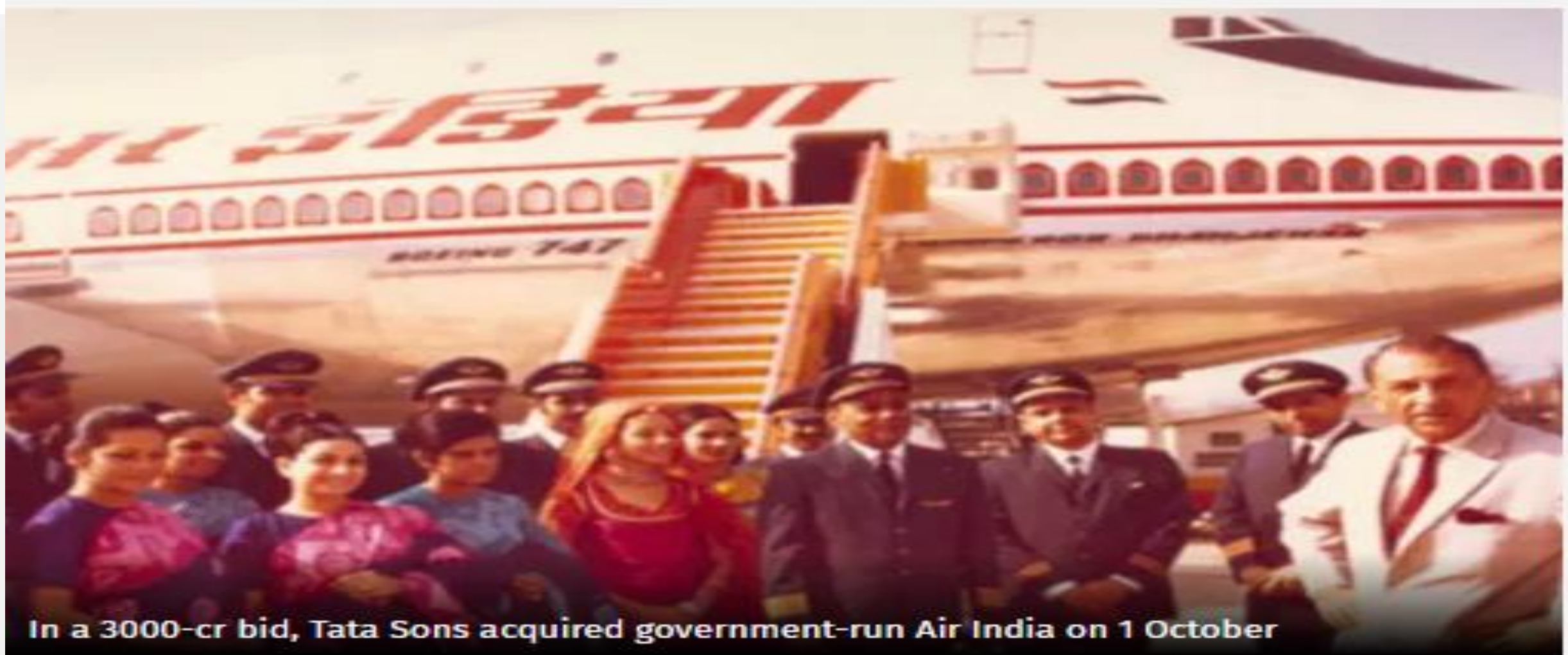
In a 3000-cr bid, Tata Sons acquired government-run Air India on 1 October