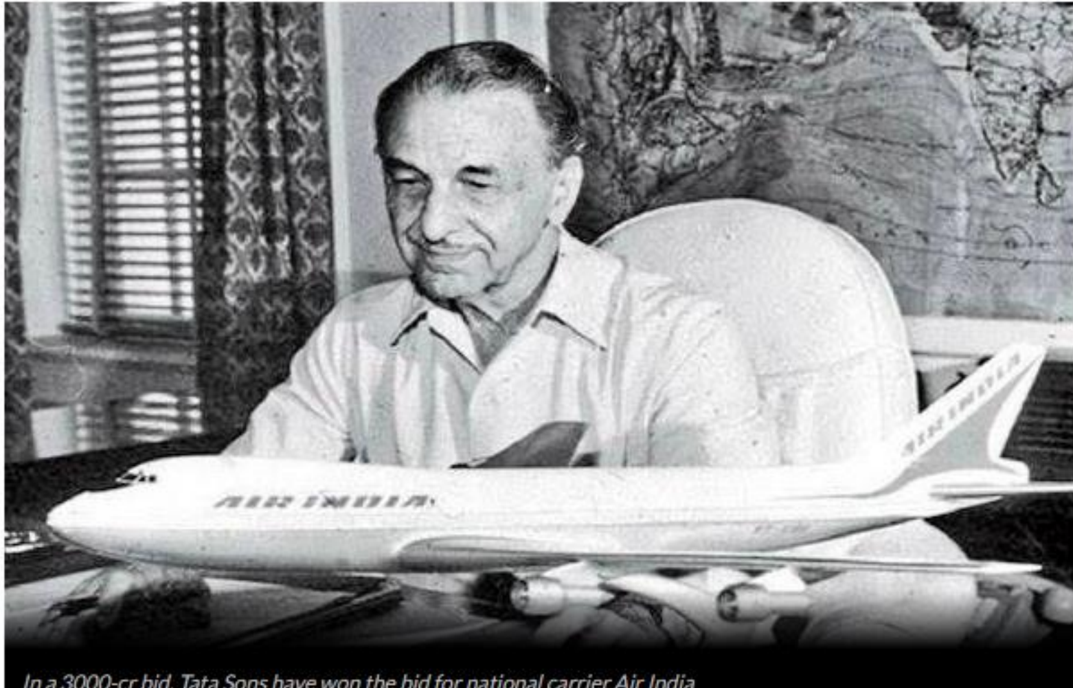
In a 3000-cr bid, Tata Sons have won the bid for national carrier Air India

I n a 3000-cr bid, Tata Sons acquired government-run Air India on 1 October. The group submitted their final bid for the airline on 15 September and have emerged as the highest bidders for the acquisition. The proposal was accepted by a panel of ministers just a day after the director of the airline, Jitender Bhargav, predicted that Tata Sons would win the bid.