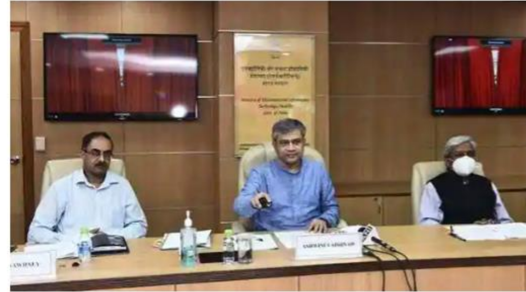
Ashwini Vaishnaw launching the Visvesvaraya PhD scheme

Centre launches phase 2 of Visvesvaraya PhD scheme to support researchers in ESDM and IT/ITES